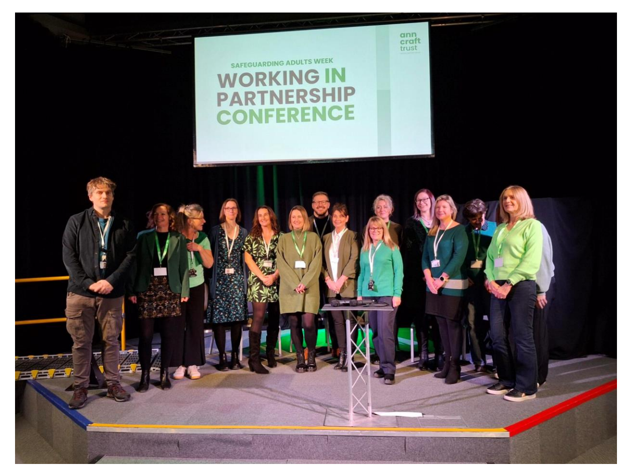
Safeguarding Adults Week 2024 - Roundup of a Week of Activity

A brief summary of all the highlights of Safeguarding Adults Week 2024; including a look back at the events we put on throughout the week, an account of our 2024 Safeguarding Adults Conference in Nottingham, and some examples of the activity that took place across the UK.